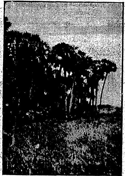
This shows the nature of the land on which ALLENTOWN is being developed. It is one of the prettiest sights of Florida.

STARTING with muck land at Okeechobee the soil of the region of which ALLENTOWN is the center, becomes a rich sandy-marl-loam as it stretches farther west. The soil on which ALLENTOWN is founded is called hammock land. The picture to the right shows the aspect of land which bears this name. The ALLENTOWN hammock land is about the best growing land that has ever been discovered. It lacks the possible sourness of muck soil and is not too sandy to require frequent fertilizing. Three crops a year are ordinary, and even four crops have been grown on land not far from here. This wonderful section is being developed from raw hammock land to improved real estate so fast that it has become one of the surprises of a state full of surprises. All around ALLENTOWN are new projects of every kind, each one being rushed to completion. This means the building quickly of more roads, more canals and more conveniences of every sort required by fast developing country. But no other development is progressing more, surely, more solidly or more soundly than ALLENTOWN. An announcement concerning the city of ALLENTOWN will be made in a few days. It will be of intense interest to anyone who desires to make a very substantial profit on a small investment.